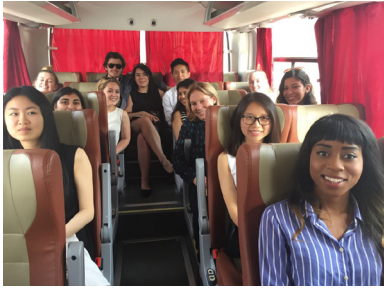
SAP students arrival to Beijing.