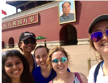
SAP students enjoyed visiting Beijing and Langfang while attending the conference.