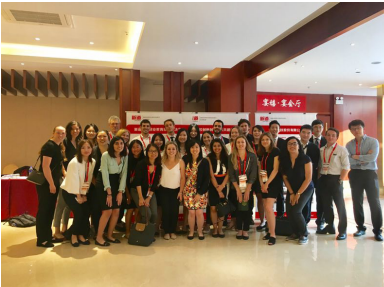
SAP students pose in front of the conference venue.