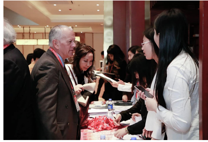
SAP students conversing with conference attendees.