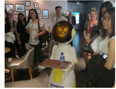
Visiting High Tech Park in Langfang on May 19th.