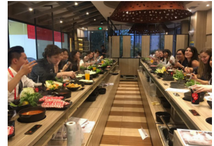
SAP students enjoyed a cultural taste in Langfang while attending the conference.